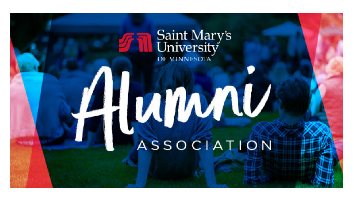
Ed.D. graduate says she belonged at Saint Mary's

Graduate School of Education Alumni Newsletter